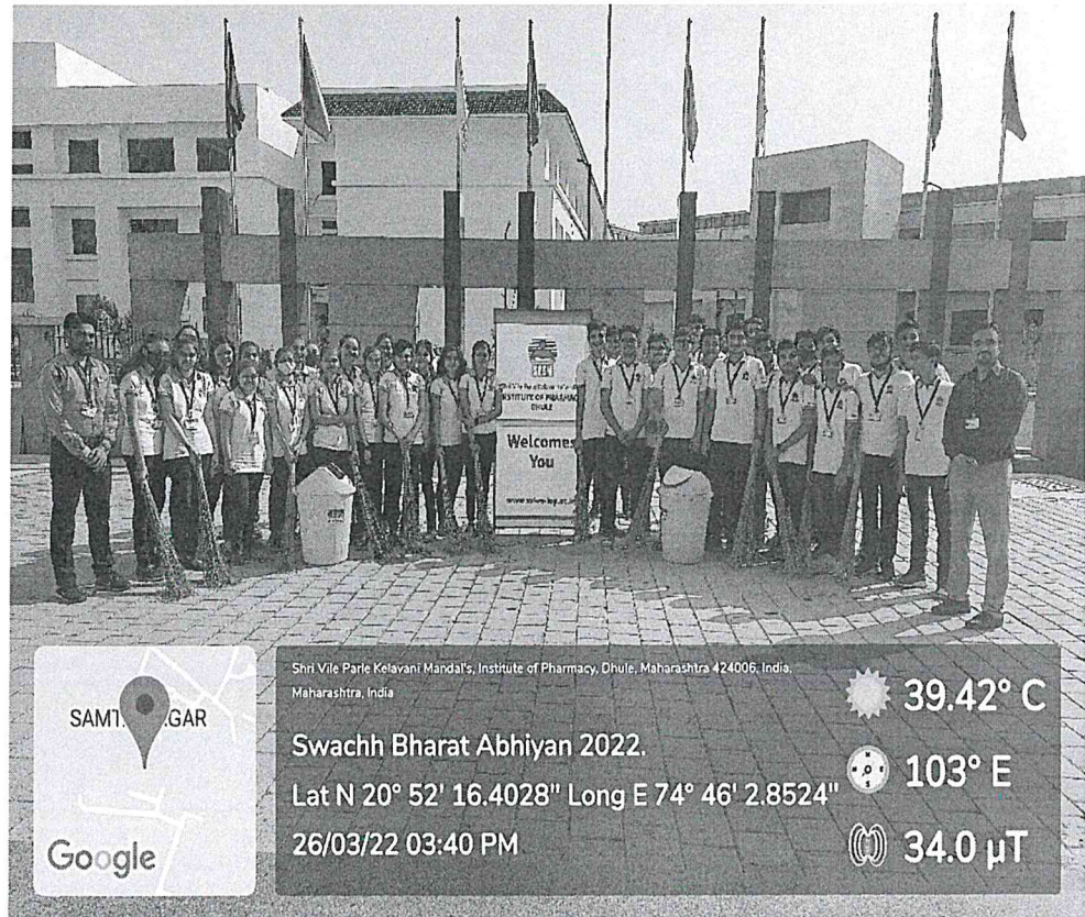
Screen shot 1

the student/teaching community. The practice of cleanliness must be on a regular and continuous basis as the concept of cleanliness leads to overall improvement of the credibility of academic institutions.